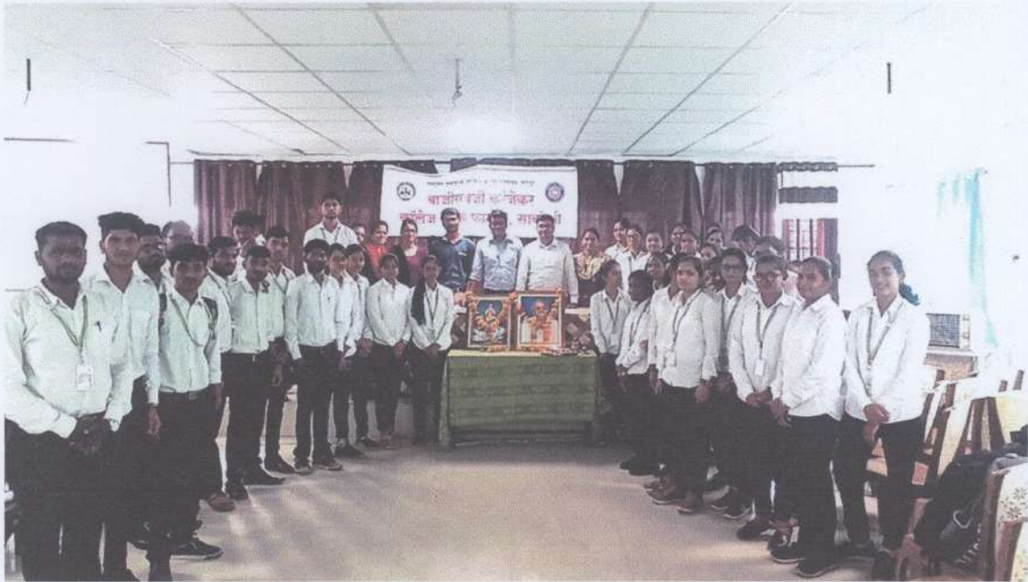
DR.BABASAHEB AMBEDKAR JAYANTI