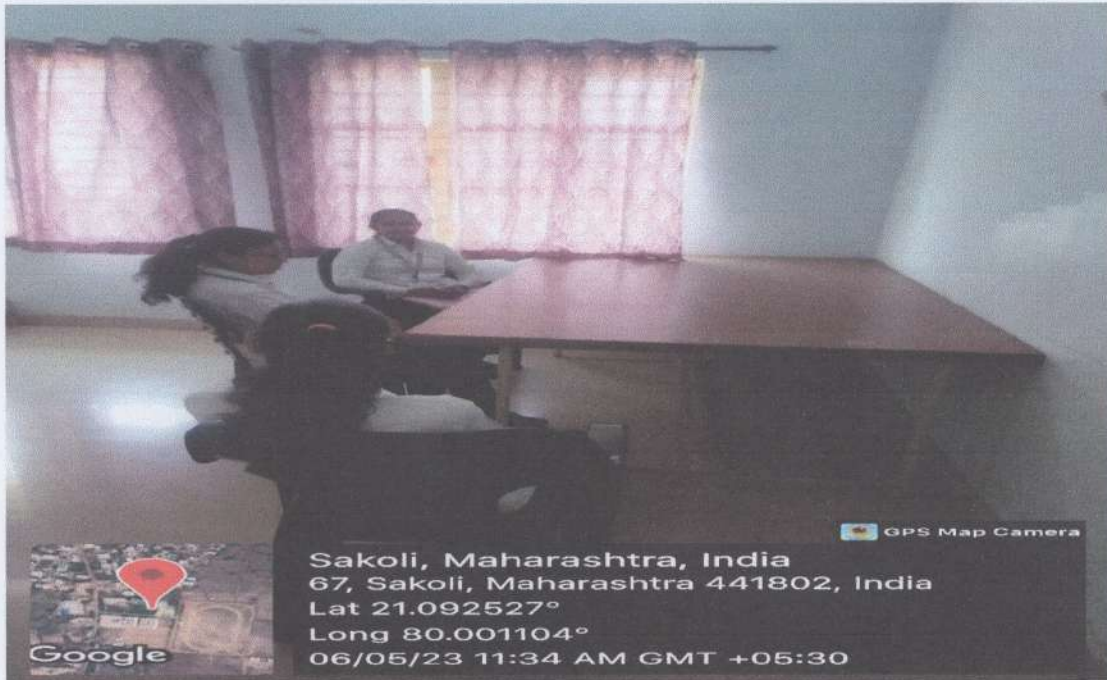
Girls Dress Code with identity card