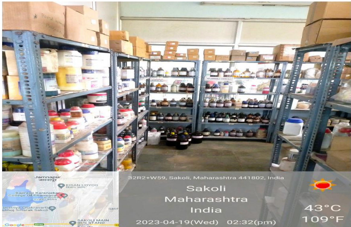
DRUG STORE ROOM