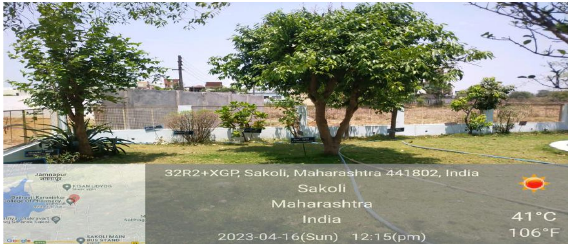
MEDICINAL PLANT GARDEN