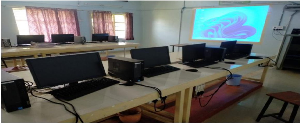
ICT ENABLED LABORATORY