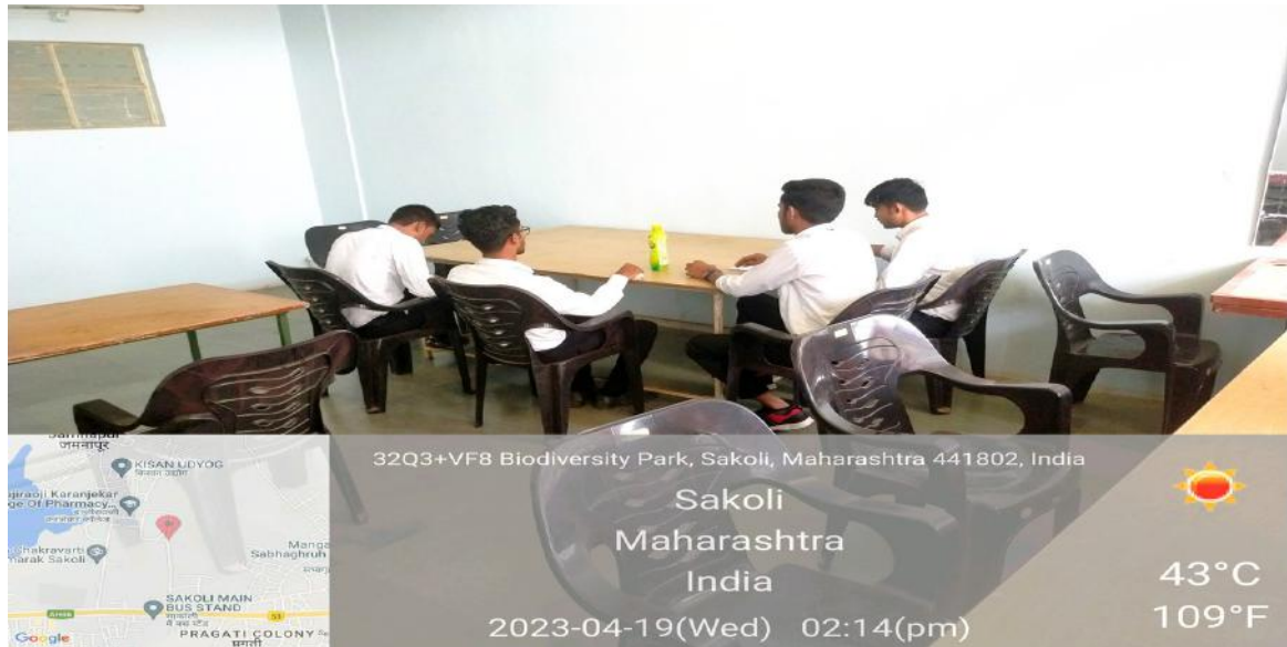
BOYS COMMON ROOM