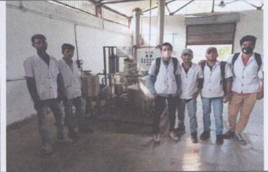
Mahua Herbal Drink Processing