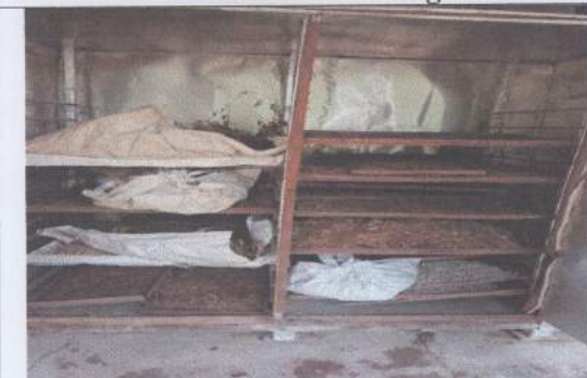
Raw material Drying