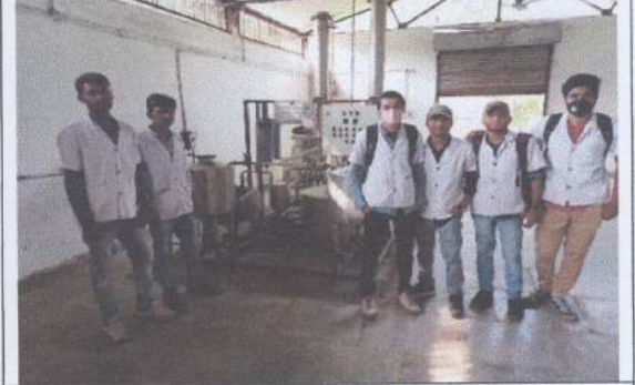
Mahua extraction Processing