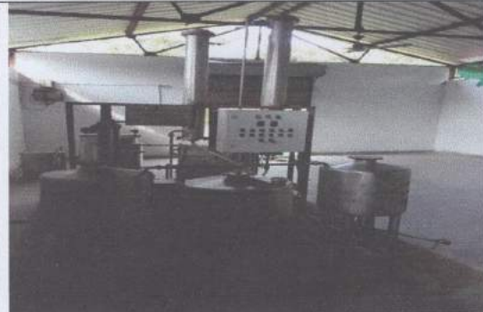
Mahua Herbal Drink Processing