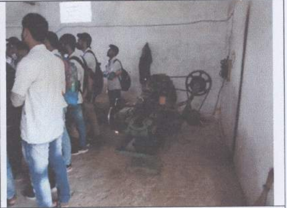
Herb Powder Processing