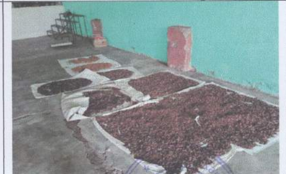
Raw material Drying

[Signature] Officiating Principal Bajiraoji Karanjekar College of Pharmacy, Sakoli