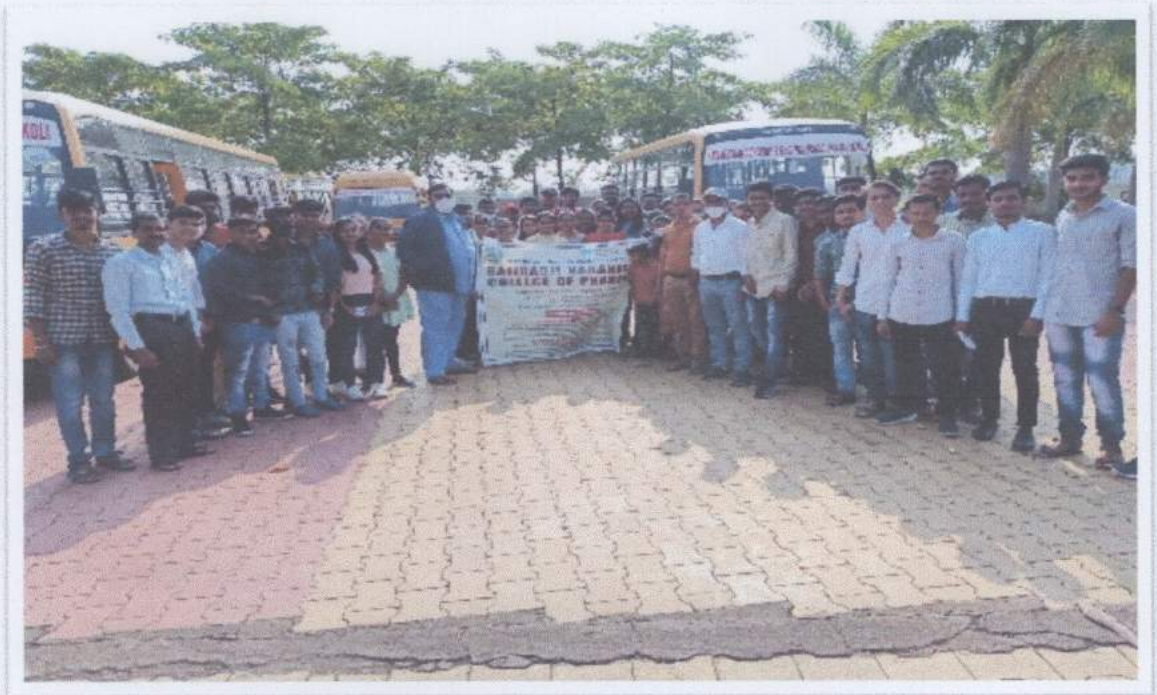
Departure of Industrial Tour From B.K.C.P College