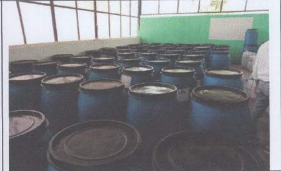
Raw material Storage