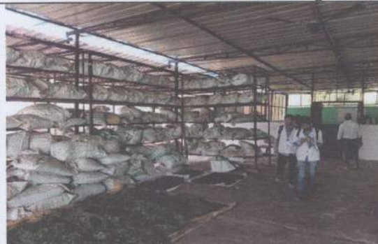
Raw material Storage