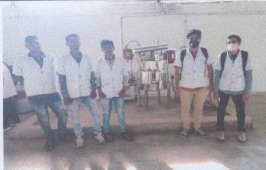
Mahua extraction Processing