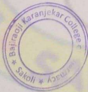
Principal B. K. College of Pharmacy Sakoli Distt.-Bhandara (M.S.)